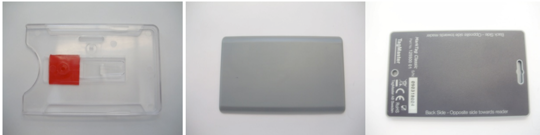
Clear Plastic Sleeve

The garage is equipped with Automatic Vehicle Identification (AVI) cards. For optimal performance the card should be mounted (using the clear plastic sleeve) on the top left (drivers side) corner of your windshield. The card must be placed in the clear plastic sleeve with the blue side of the card towards the driver and the grey side of the card against the window.